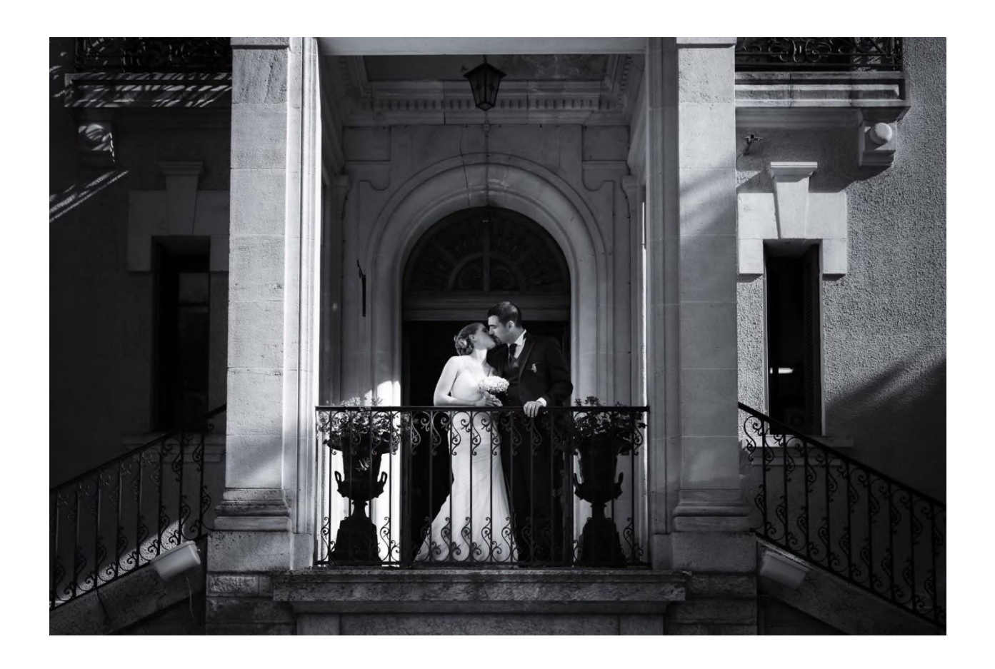
Your Wedding at Villa Morelia